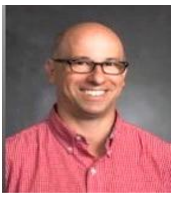
TUESDAY - MARCH 18